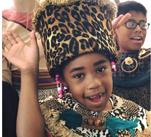
Lion King Kids, 2017

he isn't singing, he can be found hanging out with friends, playing video games, and simply having a good time. He would like to thank his family and friends for supporting him and always keeping him entertained.